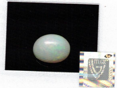
Above picture is not to scale and the colors may differ