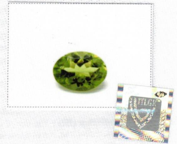
Above picture is not to scale and the colors may differ