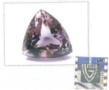
Above picture is not to scale and the colors may differ